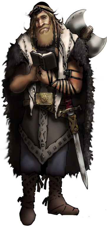
A Jewish Viking