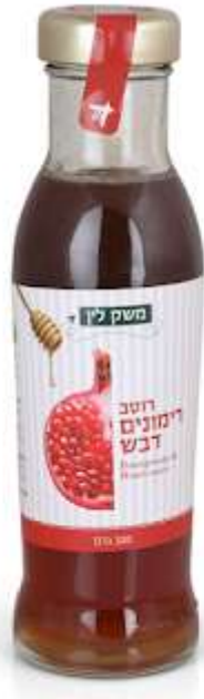
Lin's Farm Pomegranate & Honey Sauce 320 gr (Really good for grilling!)